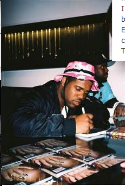
ASAP Mob member styling a pink Rothco Jungle Hat at a book-signing event