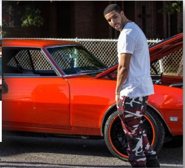
Rothco · 9 days ago Drake in our Red Camo BDU pants in his music video "Worst Behavior"